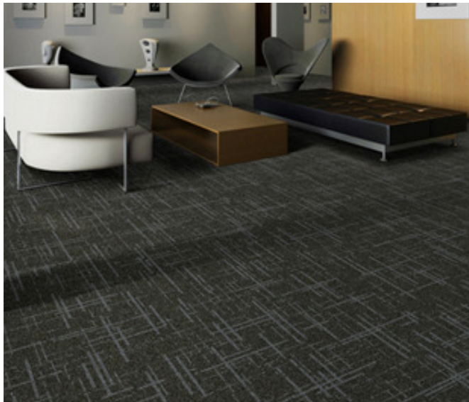
Figure 1 SDN Tufted Broadloom Carpet

The declared SDN Tufted Broadloom Carpet was made by Belgotex in South Africa in 2021. In South Africa it is sold with a 15-year warranty for flooring application in commercial sectors.